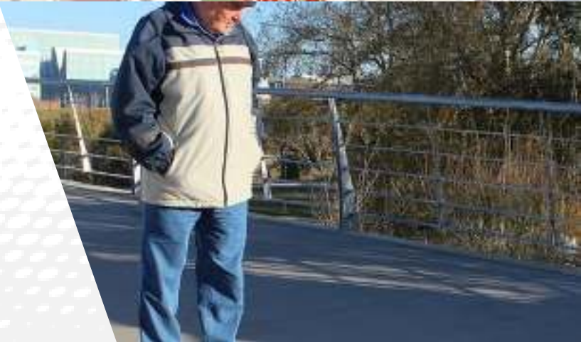
Terminillo (Delicias). Rutas Amigables